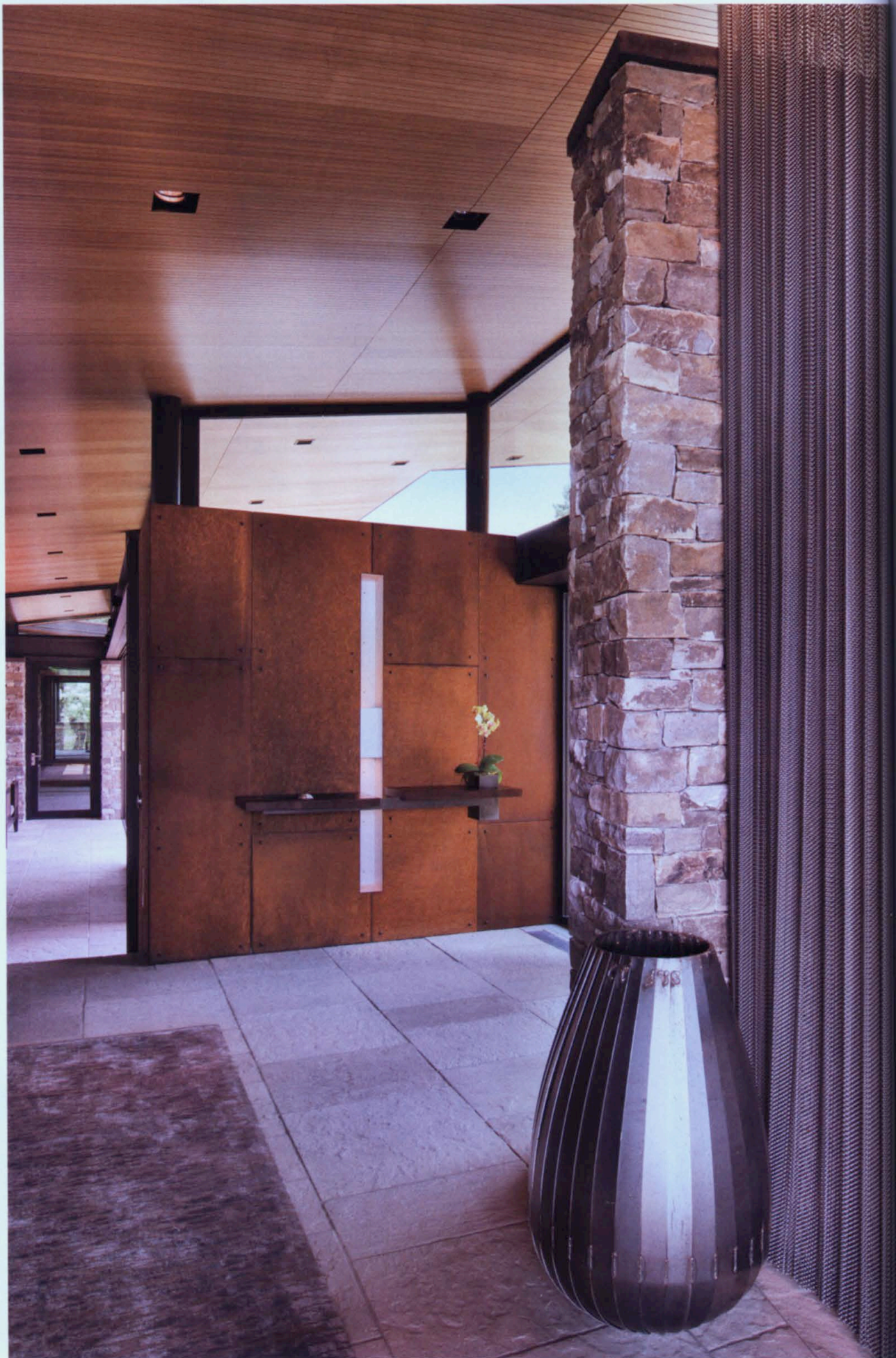
In the foyer, a metal shelf and integrated vase by Mayer Designs hints at the earthy, warm palette that appears throughout. Solo acoustical planks from Decoustics clad the ceiling and make the adjacent great room an acoustically sound space.