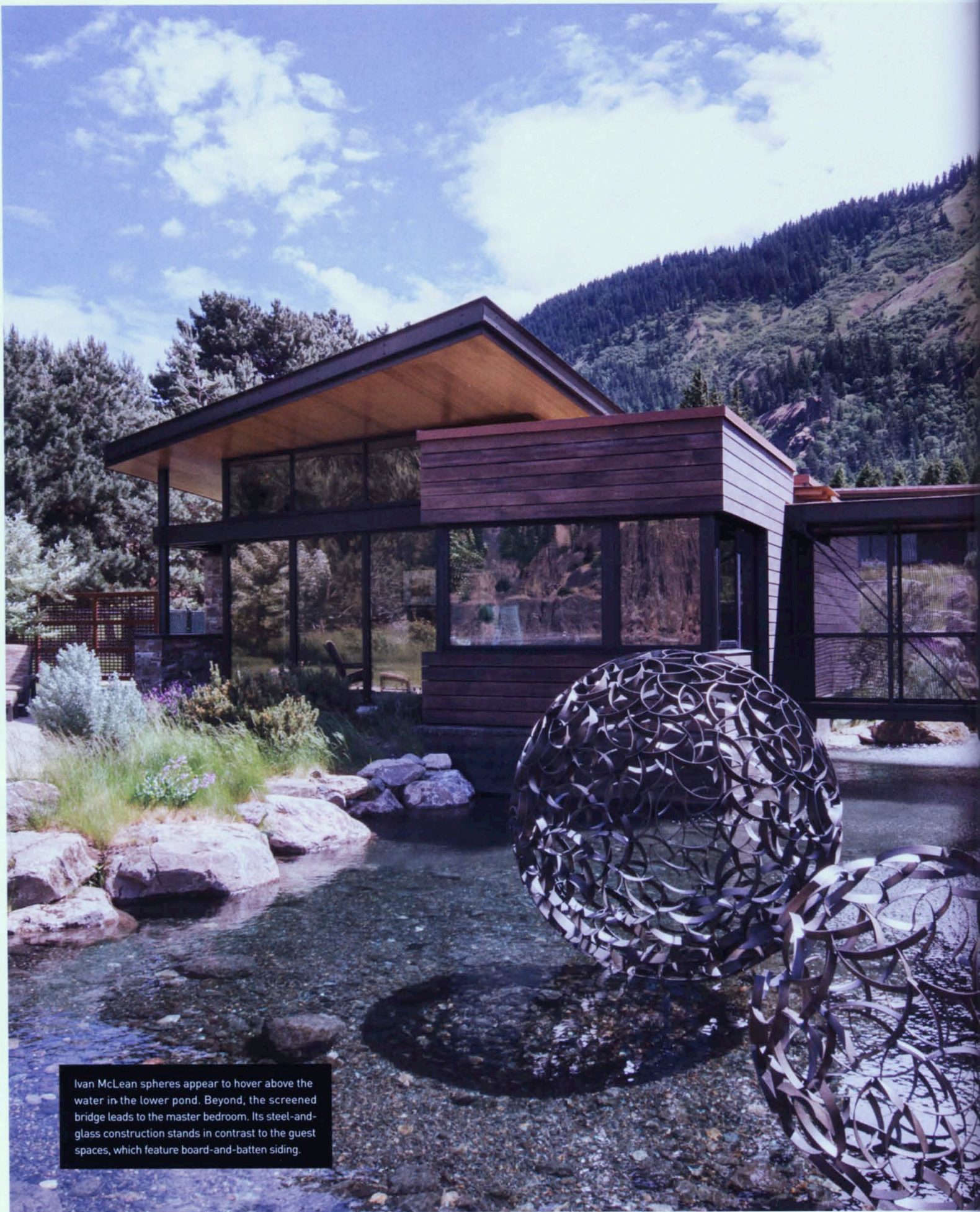
Ivan McLean spheres appear to hover above the water in the lower pond. Beyond, the screened bridge leads to the master bedroom. Its steel-and-glass construction stands in contrast to the guest spaces, which feature board-and-batten siding.